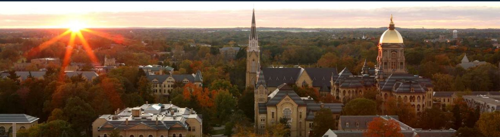
Skyline view of the Notre Dame campus

To determine BIOS' strengths and challenges, the Strategic Planning Committee gathered baseline data on the department from within the University and from Academic Analytics, an organization that gathers data on publications, citations, books, grants, and awards for every faculty member in the country, and also implemented departmental surveys, town hall meetings, and faculty meetings. The following three attributes were identified as strengths of BIOS.