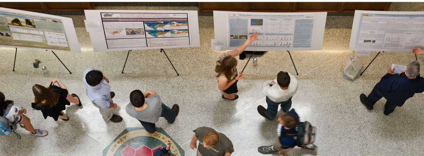
Poster presentations at Jordan Hall of Science

Hire and retain faculty that maintain and enhance the BIOS and University missions, that are committed to the BIOS vision, that build on strengths of BIOS or burgeoning research disciplines, that increase capacity to serve its undergraduate and graduate students, and that enhance cultural competency and diversity within the academy.